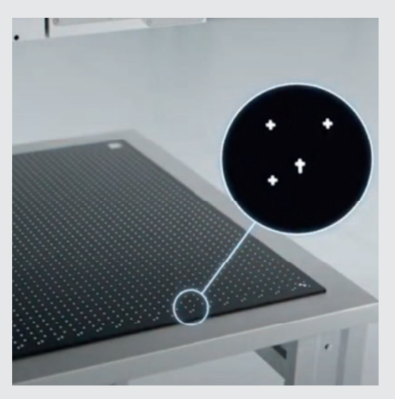
Calibration of the overlap area of an AM machine made of four AM-MODULE III

A precisely calibrated processing field is crucial for the part quality of an AM machine. Poor calibrations lead to measurement inaccuracies, geometric deformations and misalignments that can quickly render the build parts useless, especially in aerospace and medical applications. In addition, accurate and regular calibration ensures reproducibility across different batches, which is important in a serial production. But the calibration of AM machines and especially multi-head systems is complex and time-consuming.